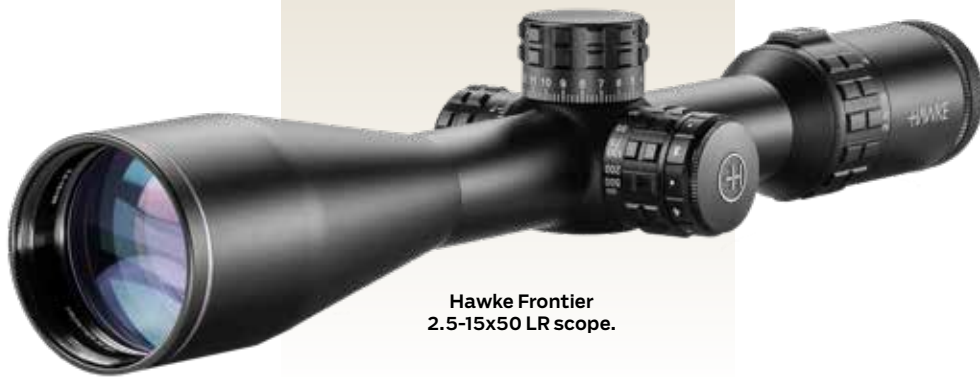
Hawke Frontier 2.5-15x50 LR scope.

2.5x15x50 LR. It ticked off every one of my requisites, including a non-cluttered lighted dot reticle, a reticle that uses thicker outer posts for quicker target acquisition in low light, but thinner inner posts, centered by a dot, to keep the target visible when aiming. Meanwhile, only the dot is illuminated (six levels) so you don't have to deal with the glare of a fully illuminated reticle. The lower thin portion of the vertical post also includes a number of hold-over aim points.